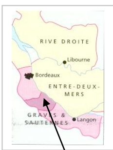
North-Graves Area of Production