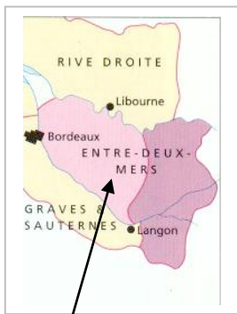
Bordeaux Area of Production

The total 35-hectares vineyard of Château des CEDRES is situated in Paillet in the hearth of the 1 eres Cotes de Bordeaux and Cadillac Appellations. With an incredible and unobstructed view on the Garonne Valley at more than 120 meters altitude, the 86.45-acres vines have an exceptional exposure and natural draining. Cultivated following the Sustainable Agriculture practices for more than ten years, Château des CEDRES produces very expressive Red Bordeaux, 1 eres Cotes de Bordeaux, and also sweet white Cadillac Appellation wines.